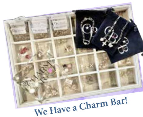
We Have a Charm Bar!

SHOPPING CAN IMPROVE MENTAL HEALTH— YOUR RETAIL THERAPY STARTS HERE!