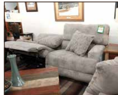
From This ▲ to This ▲ in Seconds